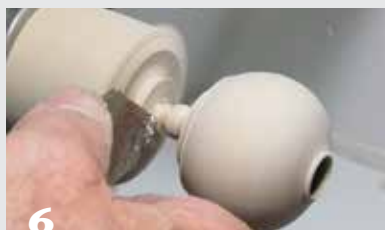
6 Part the globe from the waste block. Turn the lathe speed down and, as the globe just starts to wobble, cup it with your right hand and catch it as it comes free. Alternatively, part it most of the way through, turn off the lathe, and finish parting with a fine-tooth handsaw.