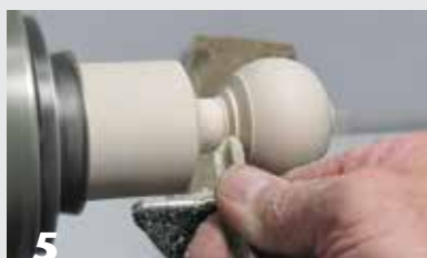
5 Detailing what will become the top of the ornament.

If you need to retouch or change the outside of the piece, bring the tailstock