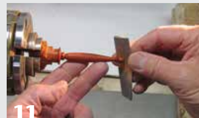
11 Finish the bottom of the drop finial using a detail gouge and, after the tailstock is removed, a bit of abrasive to remove the small divot from the tailstock live center.