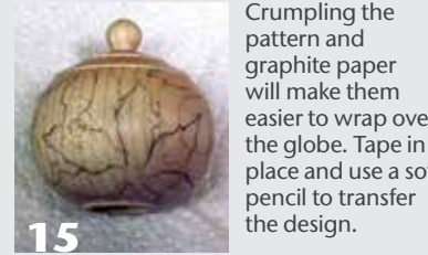
15 Crumpling the pattern and graphite paper will make them easier to wrap over the globe. Tape in place and use a soft pencil to transfer the design.