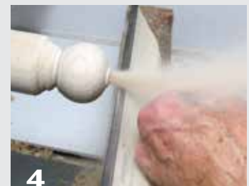
4 A blast of air will remove the shavings from inside.