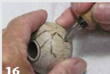
16 Karen uses a shading tool to highlight the flower petals.

top of the orb using a spindle or detail gouge ( Photo 5 ). Part off the ornament body ( Photo 6 ). To finish turning the absolute top of the ornament, reverse chuck it onto a jam chuck. Make a small tenon cut on the waste block remaining in the chuck. The tenon should be sized for a snug fit into the opening of the globe ( Photos 7, 8 ). With the tailstock brought up for support (gentle