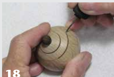
18 Geometric details, such as these accent lines, are added with a tiny ball tip stippled one at a time around the piece. Stippling provides a pleasing line without the irregularities associated with trying to “draw” on the wood.

pressure only), finish turning the design elements at the top of your ornament ( Photo 9 ). Remove the orb from the jam chuck and hand sand the small area that was inaccessible when the tailstock’s live center was in place.