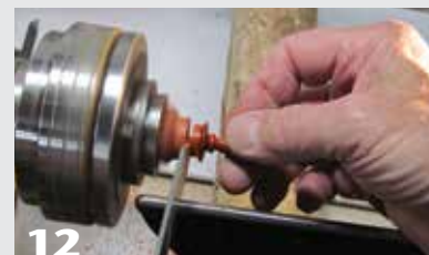
12 Hold the finial as you part it off the lathe. Note the small tenon at the base of the finial, which provides a good fit into the opening of the ornament body.