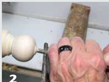
2 Leave a good mass of wood between the globe and chuck for added stability during hollowing.