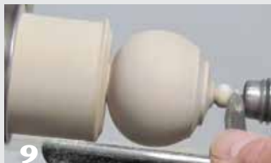
9 The tailstock live center brought gently in contact with the top will hold the globe in place as you finish the top. The small divot left by the center point can be dressed with a bit of abrasive and will leave a handy reference point to drill the hole for a screw eye.