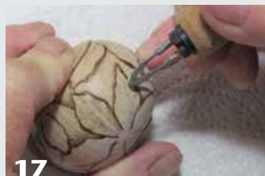
17 Rather than trying to “draw” lines with the burner as you would with a pencil, touch the tip of the stylus to the line and pull it away quickly at a ninety-degree angle. This will result in a more organic-looking line. With the low temperatures used here, burn flash should not be a problem. If you get discoloration, it is easily and cleanly removed by scraping with a small blade. Avoid sanding if at all possible.