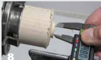
8 A snug fit makes a good jam chuck to finish turning the top of the ornament globe.