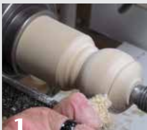
1 With the wood mounted in a chuck, shape the outside of the ornament globe. I use a \frac{3}{8} " (10mm) spindle gouge.

For the ornament body, I started with a piece of hard maple 2" square